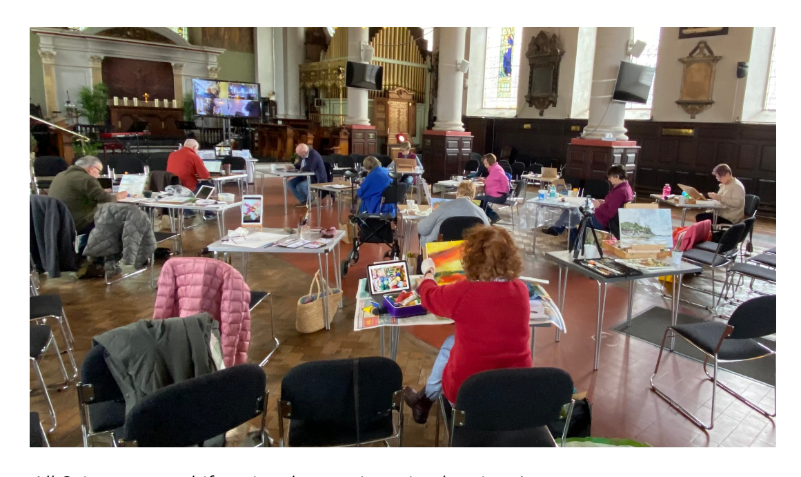
All Saints new multifunctional space in action hosting Artspace.

The SDU funded Phase 1 works have enabled us to take the first step in meeting our vision to create a multi-functional space. However there remains some way to go for the building to be fit for purpose and as the building is opened up to greater use by the All Saints and wider community, this will place greater strain on the electrics. Phase 2 of the works therefore needs to focus on further works to the electrics – the whole system requires re-evaluation (and the lighting in particular) to address the priority items raised in the quinquennial report. Alongside these internal works the most recent quinquennial report has also highlighted the need for urgent action to address the high level cracked stonework at the main façade of the church.